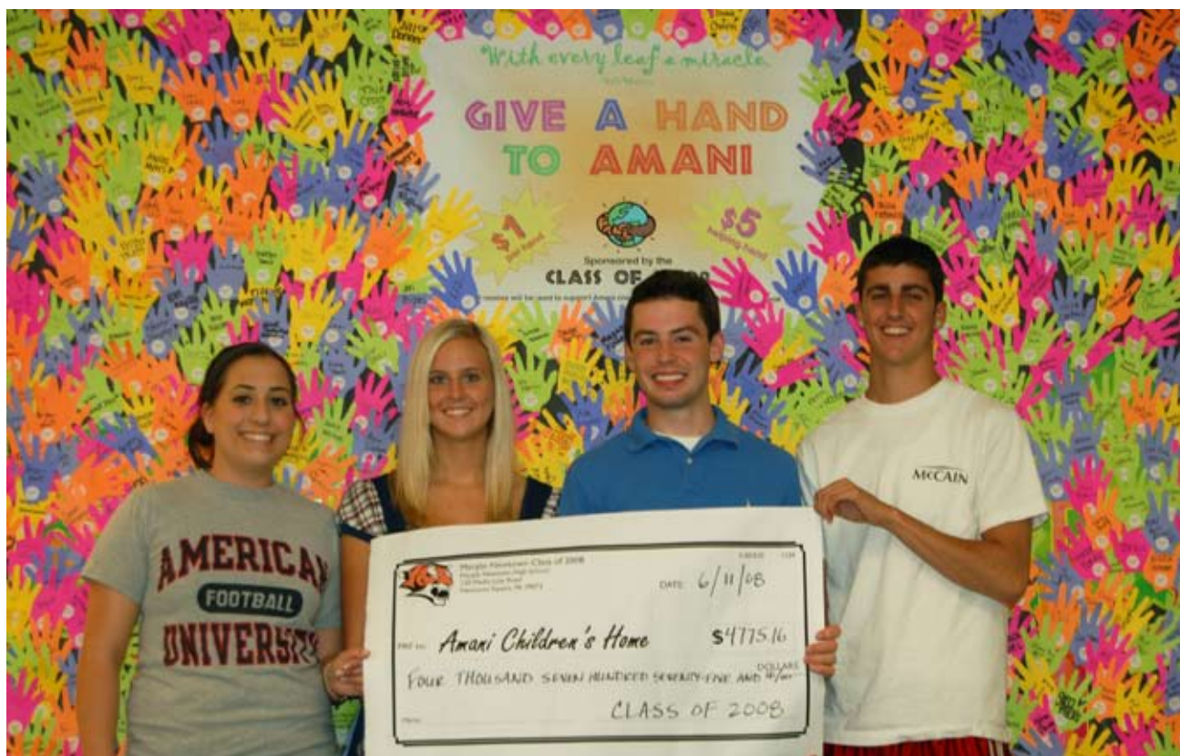
Students from Marple Newtown High School raised money for Amani at their Senior Prom.

A car wash is a great way to raise vital funds for the Amani kids. If you don't have access to a water source, or want to be environmentally friendly, and save hundreds of gallons of water, why not have a car detailing day. You and your friends could clean just the interiors of cars, and either charge a flat fee or ask for donations. You'll need paper towels (or old towels and newspapers), glass cleaner, and cleaners for vinyls and leather. If you have access to electricity, bring a heavy duty vacuum cleaner for the car's carpet and upholstery.